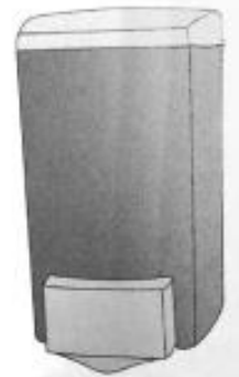
ClearVu® Encore® 30 oz. tank