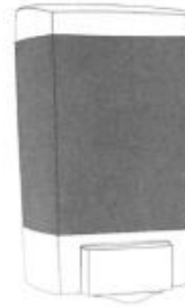
ClearVu® 46 oz. tank